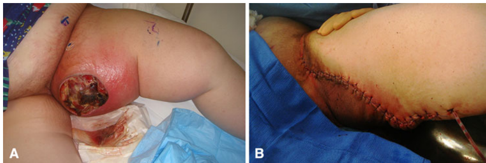
Fig. 2A–B (A) Photograph of a large fungating mass involving the adductor compartment. The patient was treated with neoadjuvant chemotherapy and radiation followed by wide resection. A wound VAC with silver negative pressure dressing was applied for 3 weeks

Institutional review board approval was obtained and patients gave consent for the use of their medical