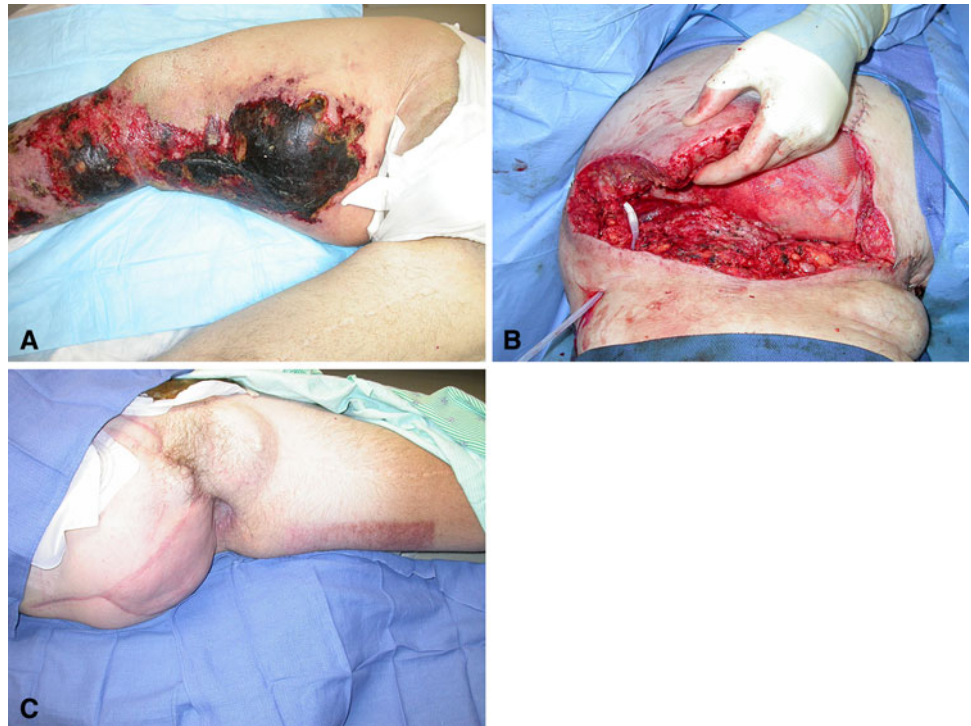
Fig. 3A–C (A) Preoperative photograph of a patient with massive chondrosarcoma recurrence involving the pelvis, perineum, and thigh. Late ischemic/necrotic changes are seen. A hemipelvectomy with perineum/genital resection was performed. (B) Intraoperative photograph after resection. The massive wound was initially managed with a wound VAC with silver negative pressure dressing followed by skin grafting. (C) Postoperative photograph 8 weeks postoperatively from resection. A well-healed skin graft is shown.

the course of the study. Related to that, wound characteristics (such as shape), adjuvant therapies, and host factors were not specifically evaluated or controlled; however, the study groups showed no significant differences in terms of immunosuppression, history of radiation, wound location, and size. Additionally, the study groups are relatively small; however, they were sufficiently large to allow us to detect significant differences between them. Finally, because this study involved a comparison of patients treated in two sequential series, the comparisons necessarily were historical. It is possible, if not likely, that other changes to treatments would have come into play during the time period in question, and it is possible, if not likely, that those cotreatments would have tended to inflate the apparent beneficial effects of silver dressings. Changes in hospital and outpatient care patterns likely also influenced issues such as duration of hospitalization over the period of time considered in this study.